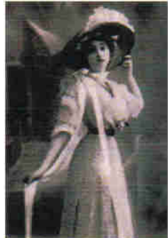
Attire relative to the age (year) of your boat.